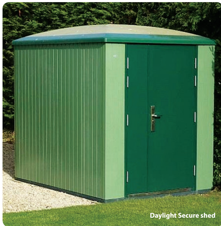
Daylight Secure shed