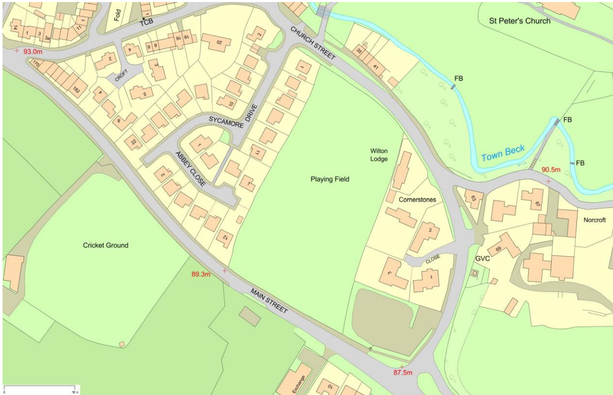
Map 1: Hoffman Wood Field